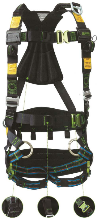
ErgoArmor™ back shield DualTech™ webbing Quick connect buckles

Innovative harness design engineered with unique components and features to improve efficiency and safety